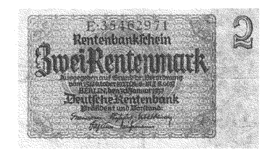
German rentenmark banknote. The rentenmark was introduced by the nationally-sanctioned Rentenbank as a gold-based parallel currency, at first circulating alongside the hyperinflated reichsmark.

Gold and silver have reportedly been declared legal currency in China, and major stateowned commercial banks there now offer gold- and silver-denominated bank accounts.<sup>2</sup>