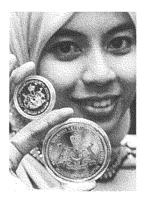
Malaysian gold dinar and silver dirham coins, produced by the state of Kelantan. In 2002, the prime minister of Malaysia stated the intent to create a gold dinar system to serve the entire Islamic world.

In 2002, the prime minister of Malaysia proposed the introduction of a gold dinar currency, for use throughout the Islamic world. In 2006, gold dinar coins (containing 4.25 grams of gold) were introduced by the government of the Malaysian state of Kelantan. This was followed by the state of Perak in 2011. The coins have been quite popular. However, the effort to create a usable international currency based on the gold dinar has been hindered, in my opinion, by the fact that small denomination banknotes and coins have not yet been issued. Gold coins are much too valuable (have a high denomination) to be useful in small daily transactions by themselves. Also, banking arrangements based on the new currency have apparently not been established yet.