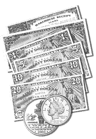
Liberty Dollar notes and coins.

Although the use of other countries' national currencies is largely accepted in the U.S., the issuance of alternative currencies within the U.S. can run afoul of what are collectively known as "legal tender laws," both de jure and de facto . Beginning in 1998, a private businessman, Bernard von NotHaus, issued a system of coinage and paper bills called Liberty Dollars that represented warehouse receipts for gold and silver bullion. The notes and coins bore no resemblance Federal Reserve Notes or U.S. Mint coins. About 250,000 people apparently participated in the system. Although other alternative currencies have existed, such as "Phoenix dollars," Baltimore's "BNote," "BerkShares," "Ithaca Hours," and "bitcoin," this was apparently the only such system based on gold and silver.