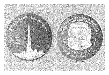
Proposed khalifa coin, intended to serve as legal currency in the Gulf States region.

Governments of the Gulf States have discussed a common currency tentatively named the khaleeji, which some have speculated would be based on gold. In August 2011, the Dubai Multi Commodities Center introduced a gold coin, called the khalifa, intended to serve as legal currency. The DMCC is in talks with the central bank of the UAE to designate the coin as legal tender throughout the UAE and Middle East.