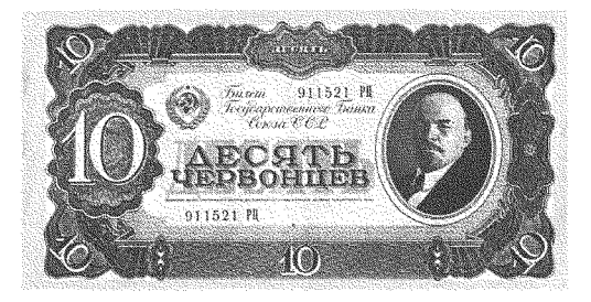
1937 Russian gold chervonets banknote. The chervonets was introduced by the Russian national government as a parallel currency to the floating fiat ruble in 1922.

Historically, before 1971, there was little reason for national governments to issue their own parallel currencies, because their primary currencies were already operating on a gold standard system. However, there is at least one example: in 1922, the Russian government introduced the gold-based chervonets currency, to circulate alongside the ruble, which at the time was a floating fiat currency. By 1947, the ruble itself had been pegged to gold, thus negating any need for a parallel gold-based currency. Thus, the chervonets was retired.