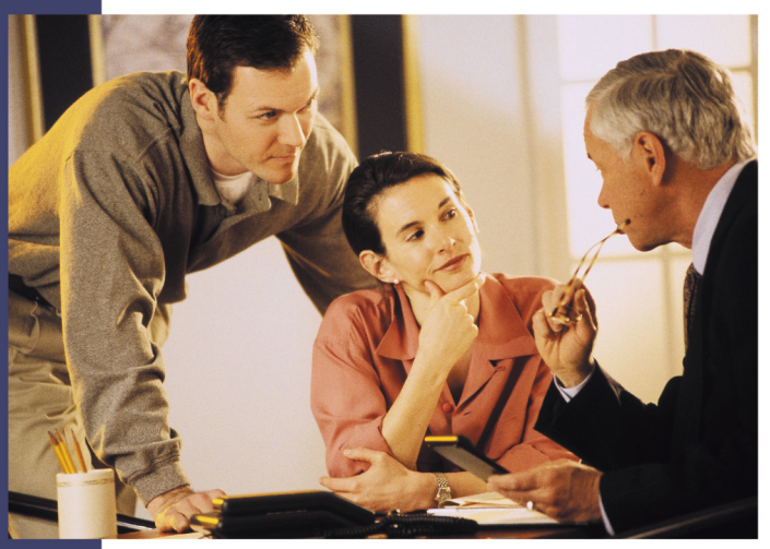
An insurance advisor can help you adjust to the new tax law.

RECENT CHANGES IN THE TAX CODE APPEAR TO GIVE A HUGE break to the heirs of high net-worth individuals. But if you think this means you no longer need life insurance as part of your estate plan, think again. As it stands, the law is set to expire in 2011, returning the tax to its current levels — if Congress lets the current law last that long. So before making any decisions, it's important to separate fact from fiction regarding estate taxes and their impact on your need for life insurance.