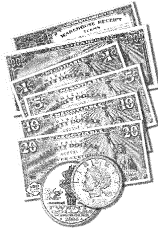
Liberty Dollar notes and coins.

Although the use of other countries' national currencies is largely accepted in the U.S., the issuance of alternative currencies within the U.S. can run afoul of what are collectively known as "legal tender laws," both de jure and de facto . Beginning in 1998, a private businessman, Bernard von NotHaus, issued a system of coinage and paper bills called Liberty Dollars that represented warehouse receipts for gold and silver bullion. The notes and coins bore no resemblance Federal Reserve Notes or U.S. Mint coins. About 250,000 people apparently participated in the system. Although other alternative currencies have existed, such as "Phoenix dollars," Baltimore's "BNote," "BerkShares," "Ithaca Hours," and "bitcoin," this was apparently the only such system based on gold and silver.