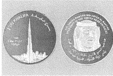
Proposed khalifa coin, intended to serve as legal currency in the Gulf States region.

Governments of the Gulf States have discussed a common currency tentatively named the khaleeji, which some have speculated would be based on gold. In August 2011, the Dubai Multi Commodities Center introduced a gold coin, called the khalifa, intended to serve as legal currency. The DMCC is in talks with the central bank of the UAE to designate the coin as legal tender throughout the UAE and Middle East.