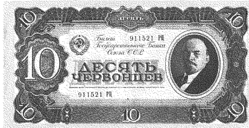
1937 Russian gold chervonets banknote. The chervonets was introduced by the Russian national government as a parallel currency to the floating fiat ruble in 1922.

Historically, before 1971, there was little reason for national governments to issue their own parallel currencies, because their primary currencies were already operating on a gold standard system. However, there is at least one example: in 1922, the Russian government introduced the gold-based chervonets currency, to circulate alongside the ruble, which at the time was a floating fiat currency. By 1947, the ruble itself had been pegged to gold, thus negating any need for a parallel gold-based currency. Thus, the chervonets was retired.