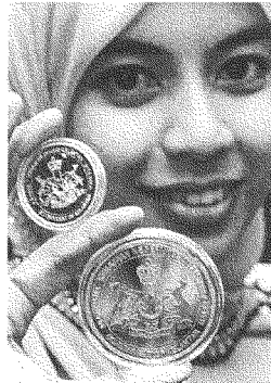
Malaysian gold dinar and silver dirham coins, produced by the state of Kelantan. In 2002, the prime minister of Malaysia stated the intent to create a gold dinar system to serve the entire Islamic world.

In 2002, the prime minister of Malaysia proposed the introduction of a gold dinar currency, for use throughout the Islamic world. In 2006, gold dinar coins (containing 4.25 grams of gold) were introduced by the government of the Malaysian state of Kelantan. This was followed by the state of Perak in 2011. The coins have been quite popular. However, the effort to create a usable international currency based on the gold dinar has been hindered, in my opinion, by the fact that small denomination banknotes and coins have not yet been issued. Gold coins are much too valuable (have a high denomination) to be useful in small daily transactions by themselves. Also, banking arrangements based on the new currency have apparently not been established yet.