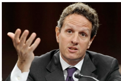
Treasury Secretary, Timothy Geithner acknowledges Dodd-Frank does not end bailouts.

But the most frightening fact of all: not even the Secretary of the Treasury, Timothy Geithner, believes that the Dodd-Frank Act ended "too big to fail." When asked about the multiple rescues of Citigroup and whether the Dodd-Frank Act ended "too big to fail" by the Special Inspector General for the Troubled Asset Relief Program, the Secretary Geithner said out loud what everyone already knows to be the truth: "In the future we may have to do exceptional things again if we face a shock that large." But the Dodd-Frank Act was supposed to save government officials from doing "exceptional things"; that is the reason for its existence. If the Dodd-Frank Act means that "in the future we may have to do exceptional things," then the Dodd-Frank Act cannot credibly be said to have ended "too big to fail."