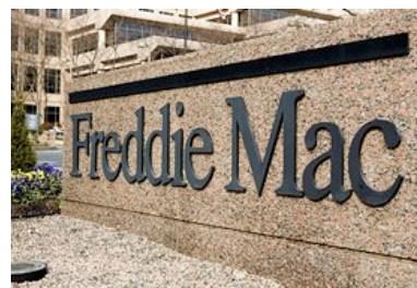
America's economic recovery will not occur until we fix problems in the housing industry.