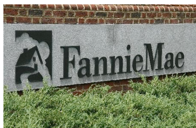
Along with other GSEs, Fannie Mae accounts for 97% of US mortgage backed securities.

Although the requirement that securitizers retain some of the risk of the loans they bundle and sell off seems relatively straightforward, the Federal Reserve found in a study that the issue is anything but straightforward. As the Federal Reserve put it, “simple credit risk retention rules, applied uniformly across assets of all types, are unlikely . . . to improve the asset-backed securitization process and protect investors from losses associated with poorly underwritten loans.” The risk-retention requirement thus has a lot in common with the rest of the Dodd-Frank Act: a complex rule, pressed into the service of a benefit that is unlikely to materialize, all with a cost to consumers, homeowners, the financial services industry, and the broader economy. As foreclosures mount, home prices continue to plummet, and the government has all but taken control over the issuance of mortgage credit in the United States, it is time to step back and think about whether the Dodd-Frank Act has put us on the wrong track.