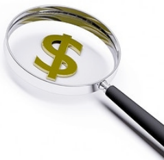
The Administration has failed to provide full transparency and disclosure.

“The struggle we are going to face in the next three to five years is going to be trying to work out sensible working relationships with the other agencies that don’t have us falling over each other and doing things three or four times. We already see some evidence of that. It will be really silly if we just wind up doing the same work multiple times and second-guessing one another.”