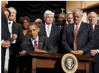
The Dodd-Frank Act was signed into law by President Obama on July 21, 2010.

credit for consumers and small businesses and hindering job creation. Republicans argued that rather than ending “too big to fail,” the Democrats had succeeded in institutionalizing it, through a process whereby large financial institutions are designated as “systemically important” and made eligible for a “resolution” process that allows government bureaucrats – rather than impartial bankruptcy judges – to determine the treatment of a failed firm’s creditors, and to access taxpayer funds to satisfy those creditors’ claims. And Republicans questioned the wisdom of commissioning more than 400 new Federal regulations and creating massive new bureaucracies at a time when the economy remains fragile and the American people are demanding a less intrusive federal presence in their daily lives.