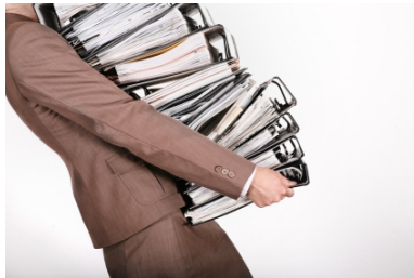
Dodd-Frank saddles American business with hundreds of new job-crushing regulations.