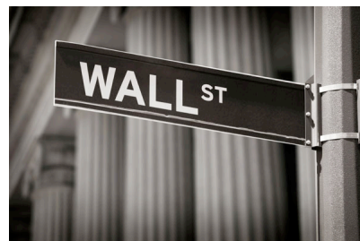
American taxpayers are still very much at risk for potential future Wall Street bailouts.