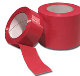
Dodd-Frank adds new layers of red tape & a crushing compliance burden from Washington.