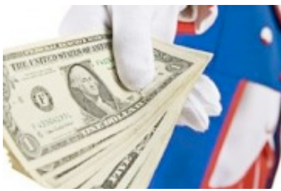
Proponents of Dodd-Frank say it ends taxpayer-funded bailouts, but facts are stubborn things.