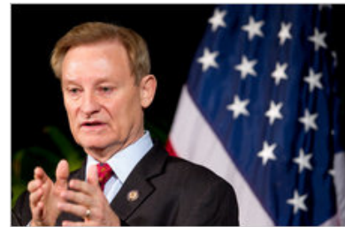
Spencer Bachus & fellow Republicans warned against the devastating effects of Dodd-Frank.

The one-year anniversary of Dodd-Frank’s enactment seems an appropriate occasion for evaluating the competing claims of the law’s proponents and opponents. The economy’s continued sluggishness – characterized by elevated unemployment levels and constrained credit conditions – calls into serious question the claims made by Democrats that Dodd-Frank would increase entrepreneurial activity and investment, trigger robust economic growth, and increase average Americans’ economic security. Indeed, the opposite appears to be the case. A pervasive climate of uncertainty about government policies is leading to fewer opportunities and less economic security for American families. Faced with a tsunami of new regulatory mandates from Washington, lenders are reluctant to expand their balance sheets and job creators are deferring plans to purchase inventory and add new employees.