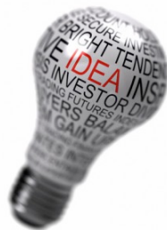
Dodd-Frank inhibits innovation by discouraging private capital from reentering markets.